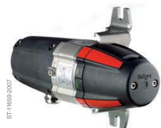
Dräger PIR 7000 Configurable IR gas detector for reliable detection of flammable gases and vapours